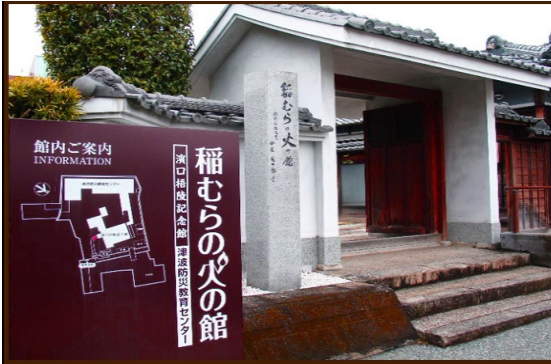
Inamura-no-Hi-no Yakata Museum