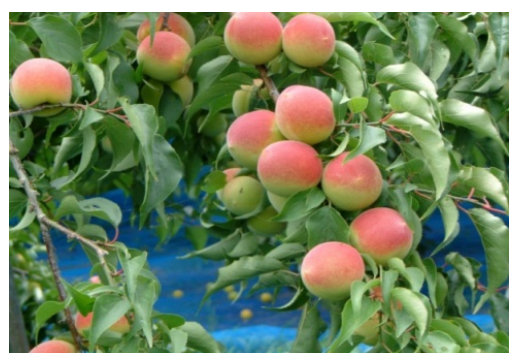
⑦ Globally Important Agricultural Heritage Systems (Minabe - Tanabe Ume System)