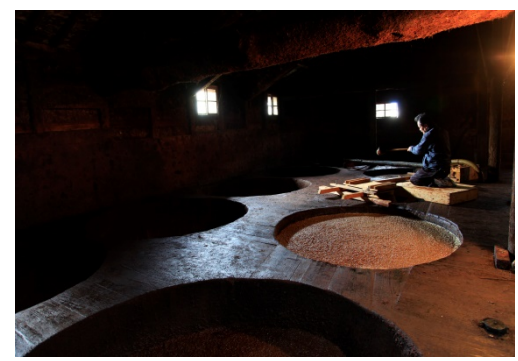
⑨ Learning the Power of Thinking through the Culture of Food