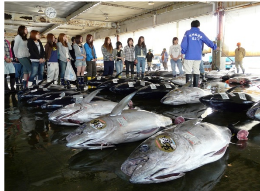
Bluefin Tuna Market Tour