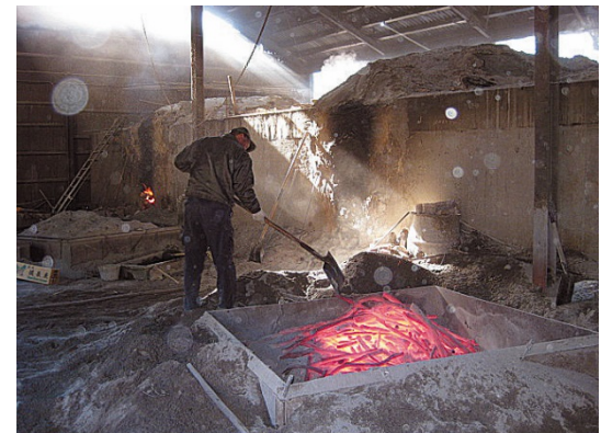
Experience working on Kinshu Binchotan (traditional charcoal)