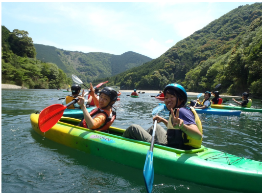
Experience river canoeing