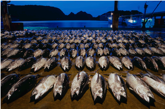
Tour in the Tuna Market