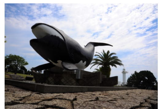
⑥ Japan Heritage “Living Together with Whales”