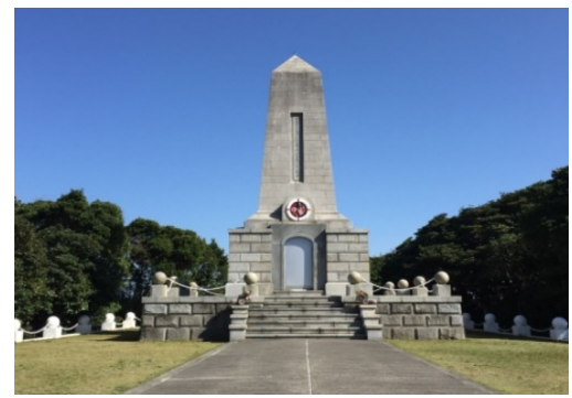
③ Learning the Meaning of “heart” from Kushimoto and their friendship with Turkey