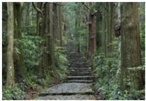
④: World Heritage Site “Kumano Kodo” Preservation