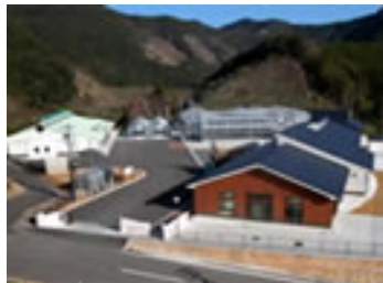
Fruit tree test center