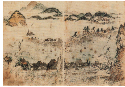
② Learning about disaster prevention (Tsunami and Landslide)