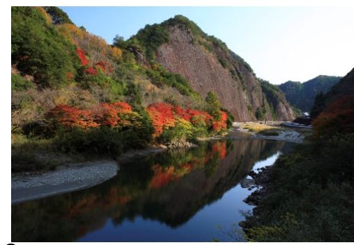
⑧ NANKIKUMANO GEOPARK ~Feel the Earth, Get to Know the Blessing of Life ~