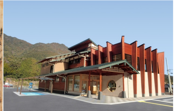
Landslide Disaster Education Center