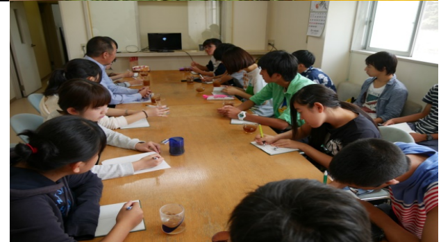
During the interview