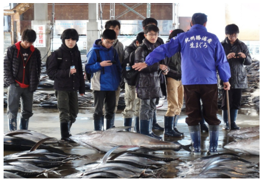
① Looking into the future of resource management - Natural and Cultivated Tuna-