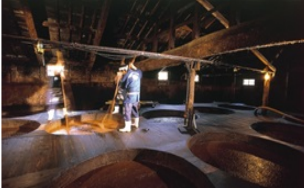
Yuasa, the birthplace of Japanese soy sauce