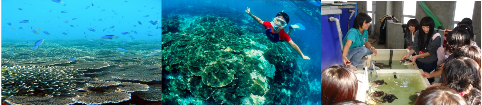
Sea of Coral Table