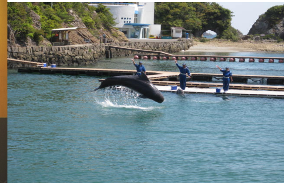
Whale contact experience