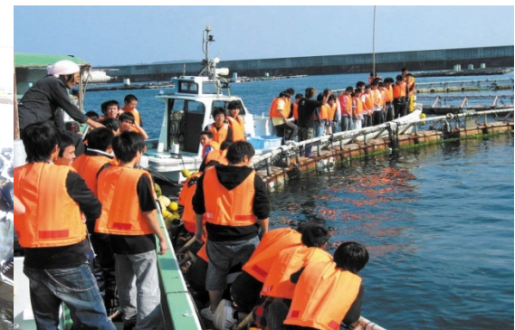
Experiencing Tuna Farm Raising